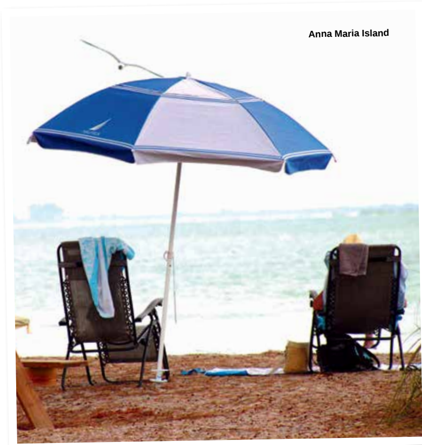
Anna Maria Island

One day he took me tracking elephants, another day we watched a lion cub get his first taste of meat. And one day we were driving along when he stopped the truck, walked me 30 meters into the bush, and pointed out a tiny chameleon curled up on a tree, no larger than a couple of inches. He'd spotted it while driving, talking and listening to the walkie-talkie. Meeting people like this makes me feel alive.