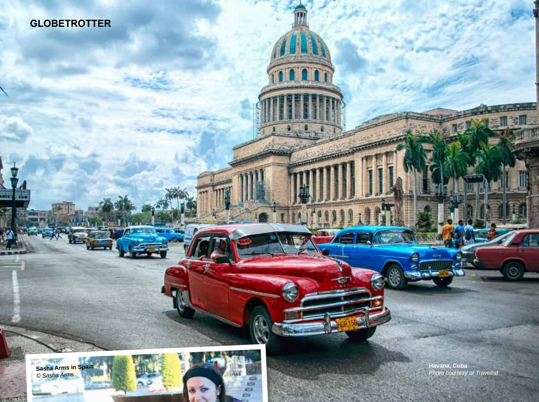
Havana, Cuba