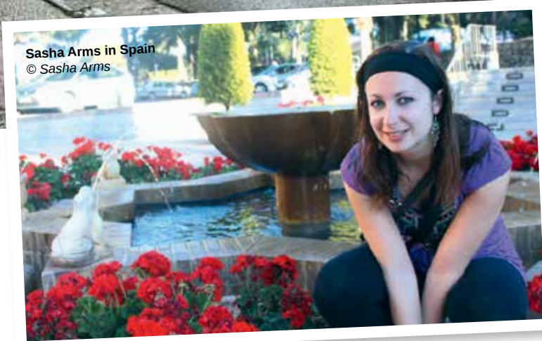
Sasha Arms in Spain