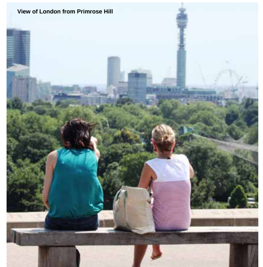
View of London from Primrose Hill

Since travel, work, and life are intertwined for me, my next destination depends on where an editor or tourism board wants to send me. I'm always open to suggestions, and if I can make the logistics work, I'll go!