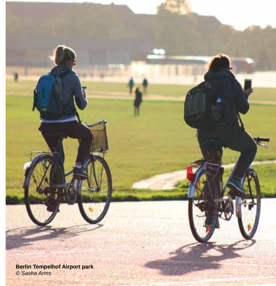
Berlin Tempelhof Airport park

"My first proper travel experience was at the tender age of 17, when I embarked on a month-long expedition to Brazil. In the Pantanal, I slept in a hammock with caiman eyes gleaming eerily nearby, and stood waist high in piranha-infested waters while fishing. I danced on the beach with locals on Ilha Grande, watched the sunrise on the Copacabana Beach in Rio, and helped build a treehouse for former street children in Belo Horizonte. I've been embarking on new travel adventures ever since."